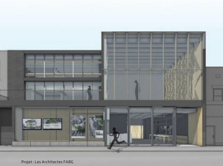
Projet: Les Architectes FABG

The Caisse d'économie solidaire has loaned $4.9 million to the creative theatre company La Manufacture to redefine and renovate its space. Located at 4559 Papineau, the Théâtre La Licorne became too small to accommodate the public's response and the contemporary theater's creative needs. Renovations will focus on showcasing performances and ensure 15 000 more seats annually which will, in turn, increase revenues.